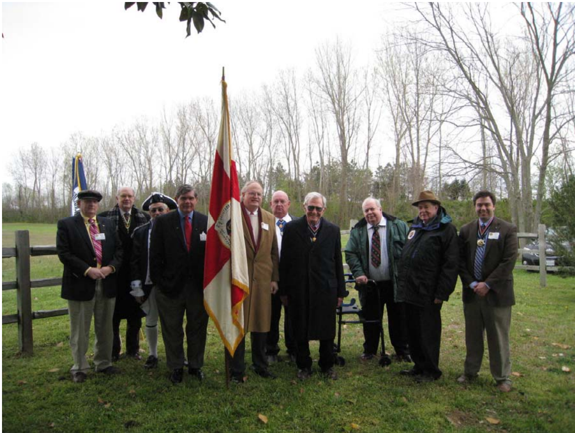
Above– Colonial Wars below- War of 1812 attending the Shirley Plantation ceremony.