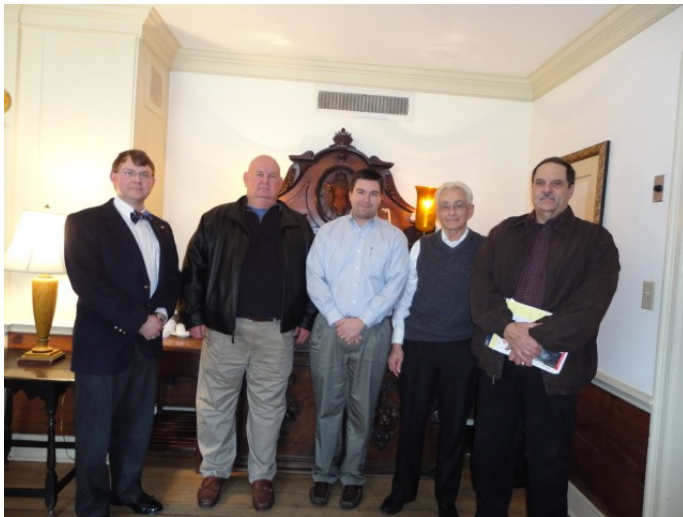
Below: at the February 6, 2011 Executive Board meeting at the Boar's Head in Charlottesville.