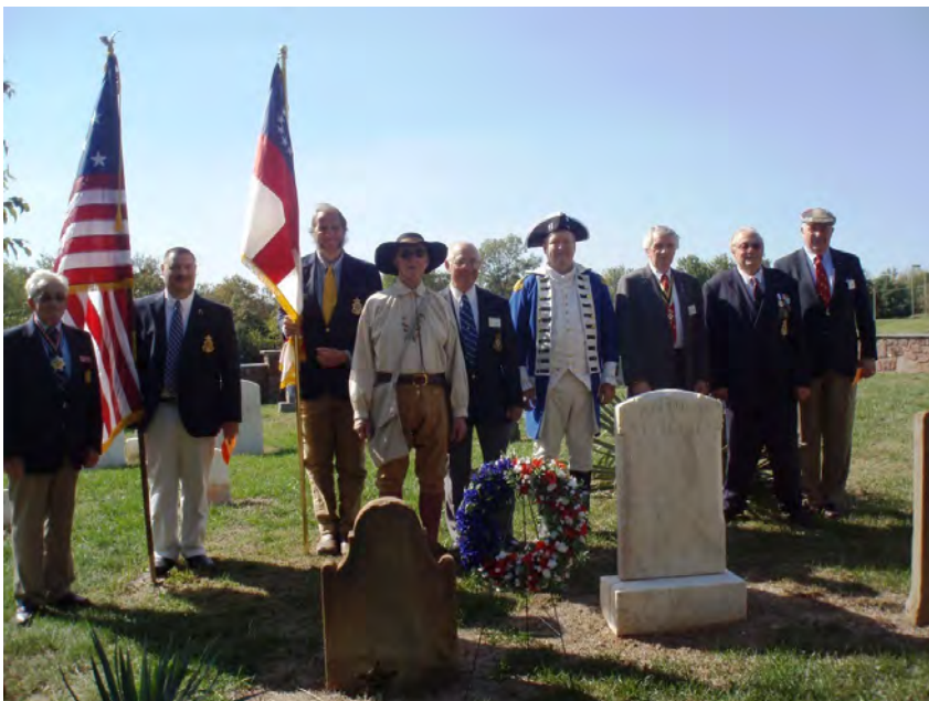
Governor Lyman representing VA OFPA at a grave marking on October 8, 2010.