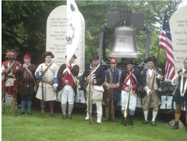
Replica of the Liberty Bell at the John Shepherd Commemoration Event, plus reenactors from the French and Indian War and the Revolutionary War.