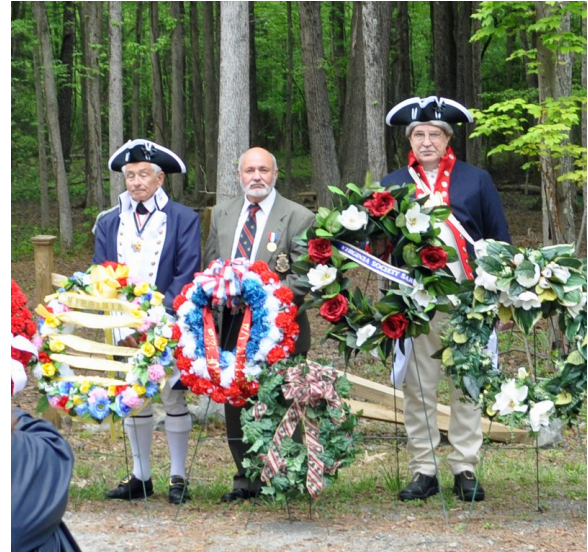
Three organizations represented here: VA OFPA, War of 1812 in VA, and VASSAR.