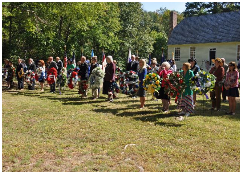
Presentation of Wreaths in front of the replica of the house where James Monroe was born.