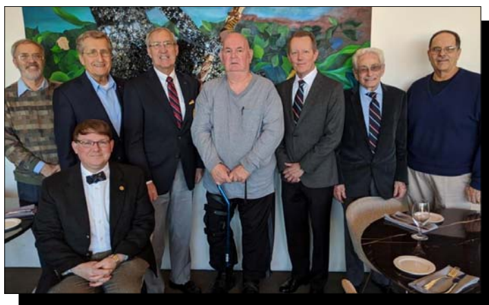
Executive Council meeting held in Richmond—January 26, 2020