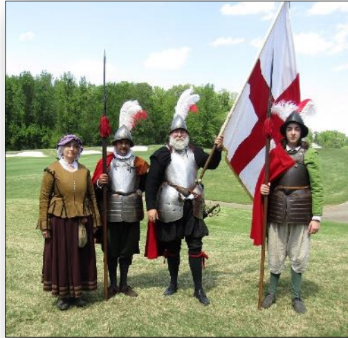
Re-enactors in period costume escorted attendees to the dedication of the below marker, installed to commemorate this august event.

During archaeological research of this area conducted in the 1990's, the remains of four English individuals—one male, two females and a female child—dating back to the 1619-1622 period were found. The final set of three remains were reinterred in a ceremony conducted using the Anglican Book of Common Prayer as it would have existed in 1619.