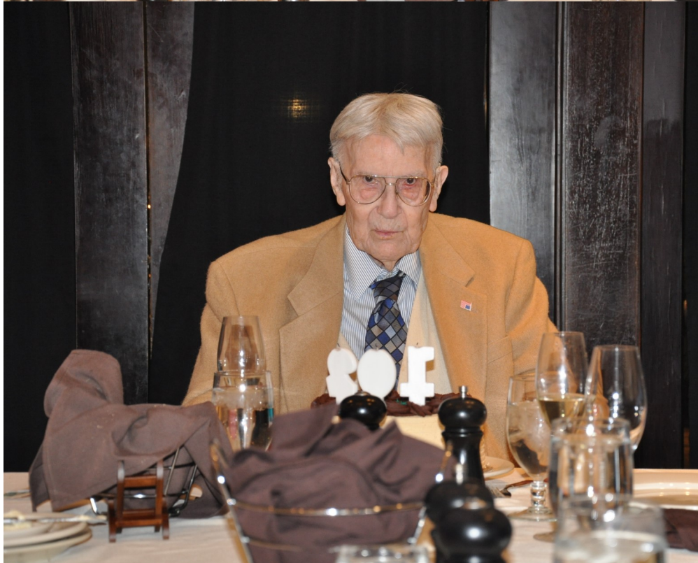
Left—(caption) I better not have one more person ask me to smile.