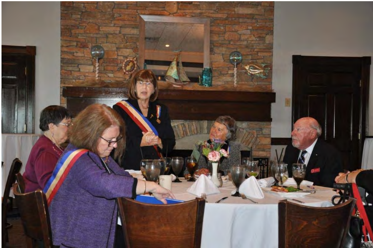
ABOVE - This photograph was taken (Oct 20, 2016) at Riverwalk Restaurant located in Yorktown, VA.