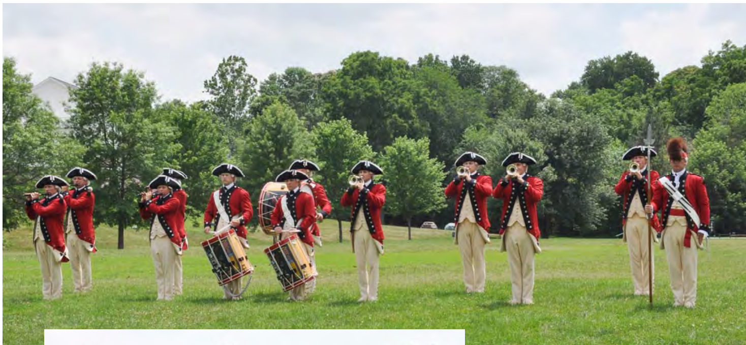
Above—U.S. Army Old Guard Fife and Drum Corps performing.