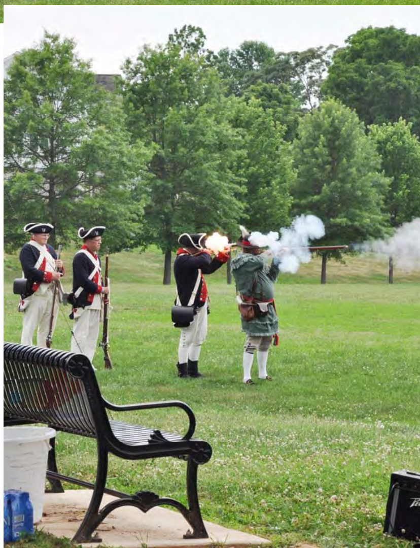
Left—One of three musket volleys being fired during the ceremony by the Culpeper Minutemen-SAR.